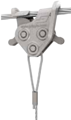
C-Clip 1/8" End Fixing Code CC-1/8

Cable Strut Wall Brackets are available as a wall attachment point for the Cable Strut Kit using the code below.