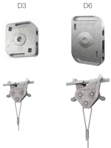
Available in 1/8" and 1/4" systems