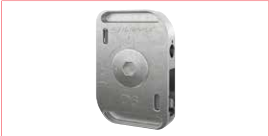
1/4" Cable Strut CTI-1/4