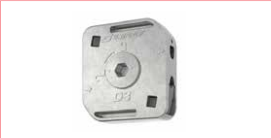
1/8" Cable Strut CTI-1/8